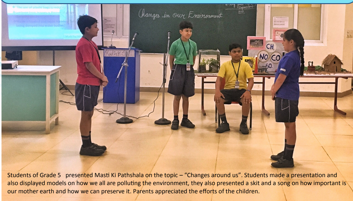
Students of Grade 5 presented Masti Ki Pathshala on the topic – “Changes around us”. Students made a presentation and also displayed models on how we all are polluting the environment, they also presented a skit and a song on how important is our mother earth and how we can preserve it. Parents appreciated the efforts of the children.