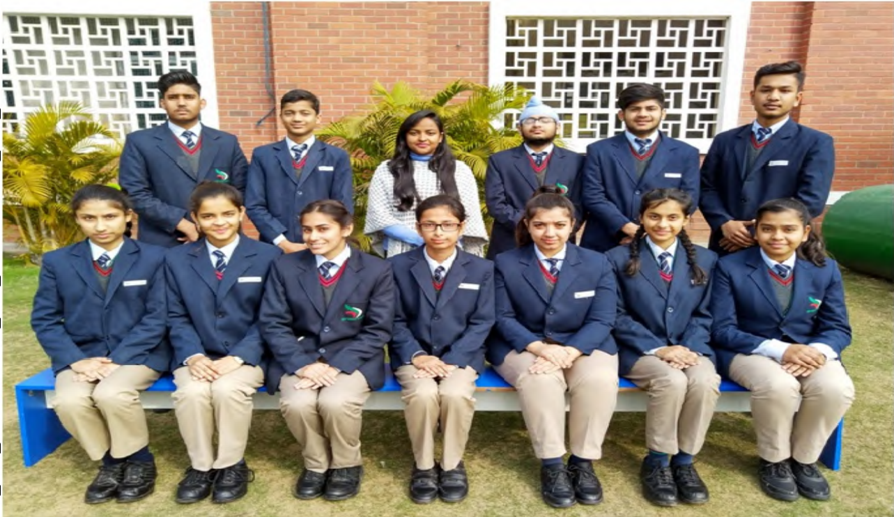
ATS Valley School (Subject - wise highest) Class - 10 (2018-19)